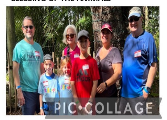
SUNDAYS TOGETHER FUN @ PB ZOO