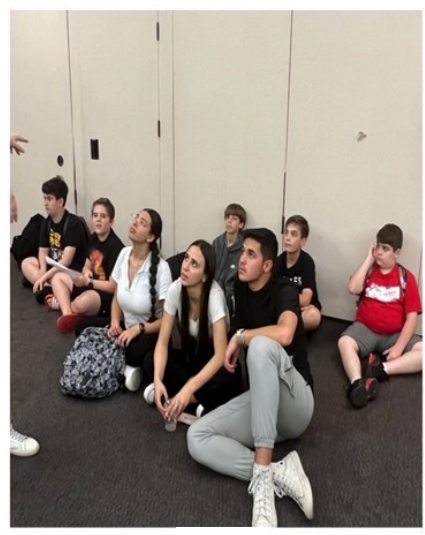
HOSTING ISRAELI TEENS MARCH '23