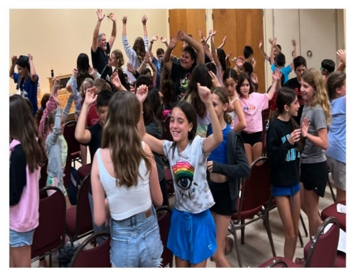
VISIT FROM BEE KEEPER FOR ROSH HASHANAH