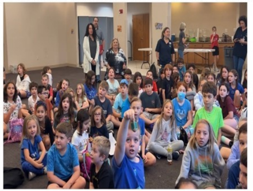
HANUKKAH CELEBRATION W/B'YACHAD