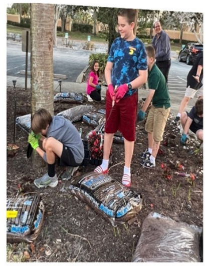
TU B'SHVAT PLANTING