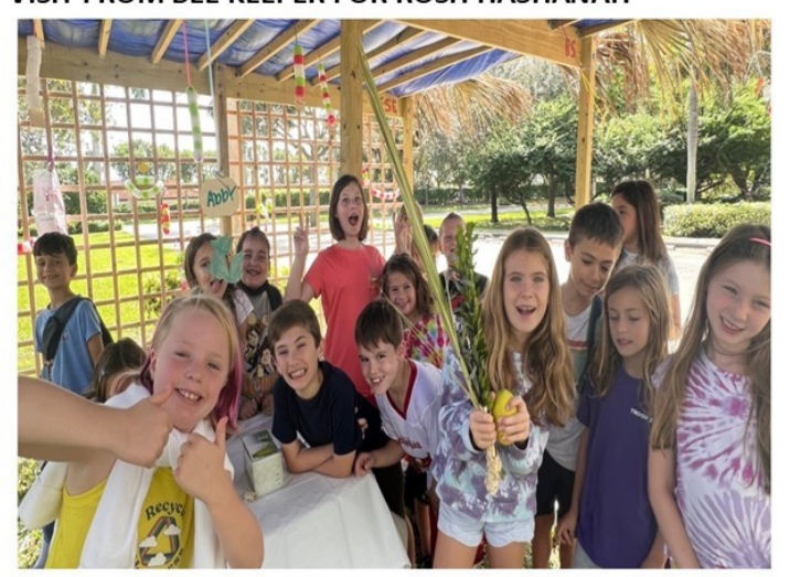
SUKKOT CELEBRATIONS DURING TSSRS