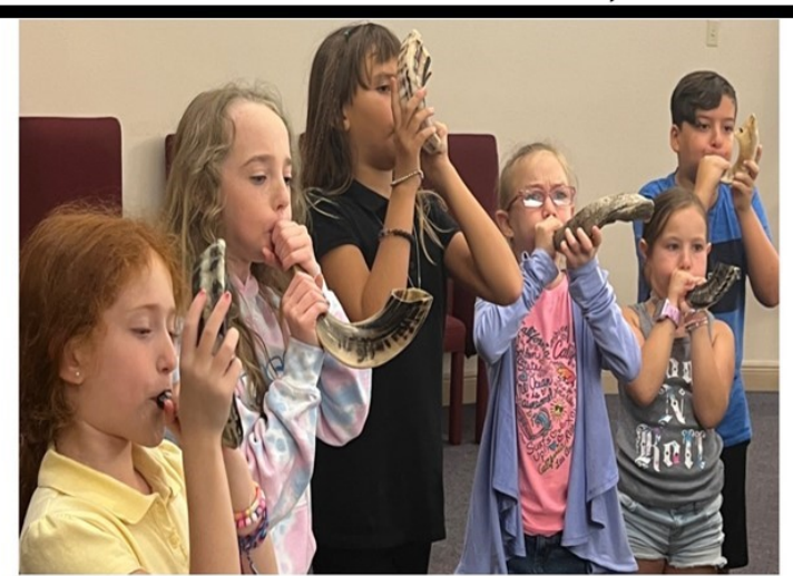
SHOFAR CHOIR 5783